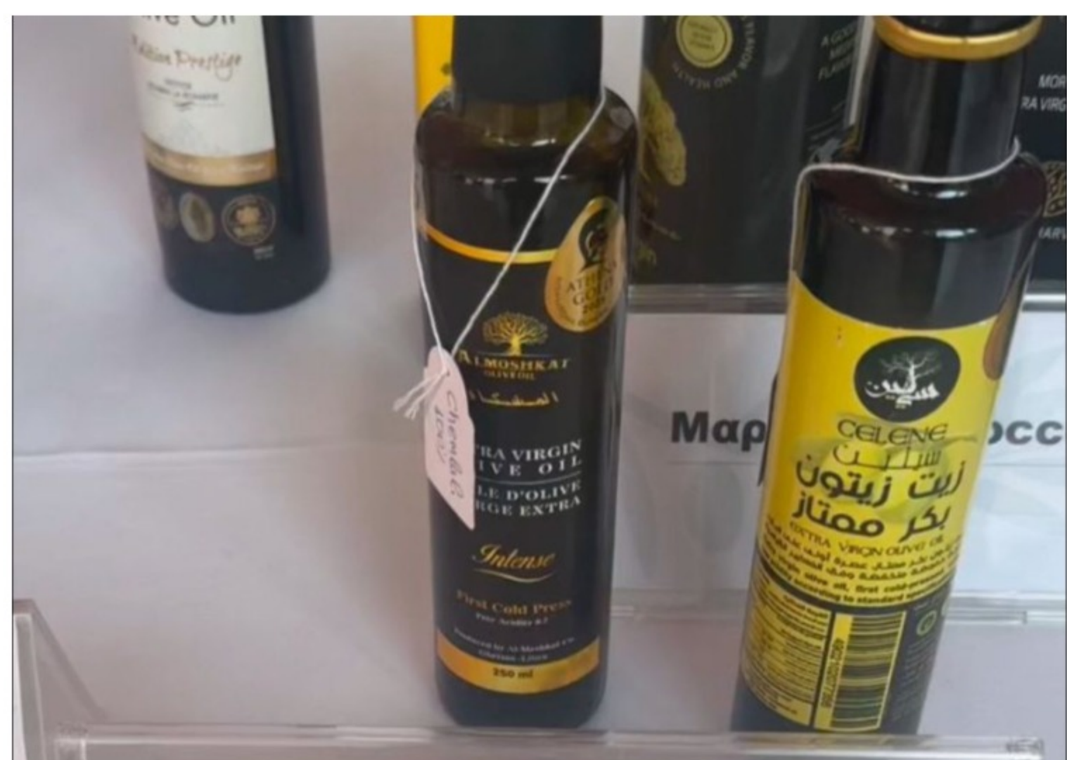
Libyan olive oils win medals at Athens competition.

Three Libyan companies won awards at the Athens International Olive Oil Competition, the Libyan Export Promotion Centre (LEPC) announced yesterday.